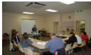
Participants at a recent workshop in Clare

Later in the month the successful "Lorraine Thornton & Associates" Retail Training workshops continue in Hallet and Robertstown with the Business Building Workshops. These will be held on 22nd and 23rd May.