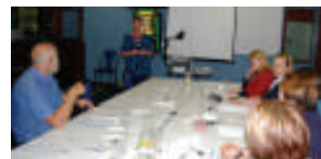
Workshop recently at Jamestown

These workshops are being sponsored by SA Works and hosted by the Board. If you would like any further information checkout our website, www.mnrdb.com.au where you can register online. If you would like to know more call our Business Development Officer on 88423115