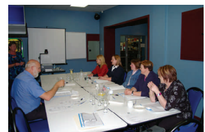
Recent workshop at Jamestown

On April 27 the public will be able to attend a meeting and have the opportunity to have their say on the SASP as well as receiving feedback on achievements to date. Further information will be provided when venues and times are confirmed