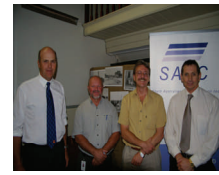
Participants at the recent forum in Burra

Questions from the floor during the open discussion session highlighted the issues of most concern for the region as being increased spending by Transport Services Division on road maintenance for the arterial road network and the need for a re-evaluation of commitment from both state and federal government for a substantial increase in capital works spending on new routes needed to service growth in the grain & fodder and livestock industries. Upgrading of the Bower Boundary Road was considered to be the most important priority and improved connectivity from Burra & Jamestown to National Highway One was also considered as a high priority.